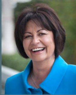
hekia parata national list mp

His aspirations for Ngati Porou have always been around self-determination and self-reliance, which include wealth creation in terms of our social cultural and economic resources. Fundamentally though, his aspiration is for us to be good to one another and to care for one another.